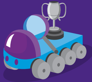
3. Delivery quality