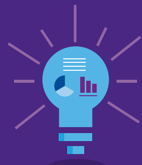
5. MI and insight