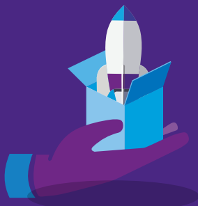
1. Ops Management Expertise and Governance