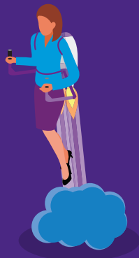
4. Flexible resourcing