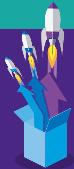
2. Rapid mobilisation