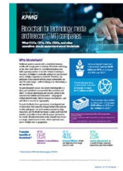
Blockchain for technology, media, and telecommunications Companies