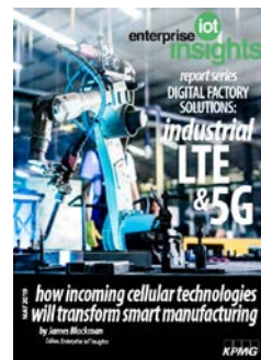
How Incoming Cellular Technologies will Transform Smart Manufacturing