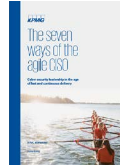
The seven ways of the agile CISO