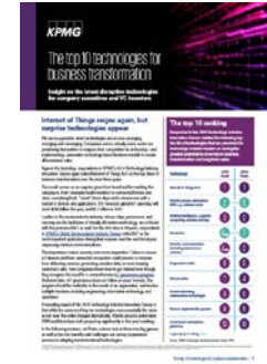
Top 10 technologies for business Transformation