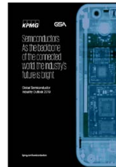
Global Semiconductor Industry Outlook 2019