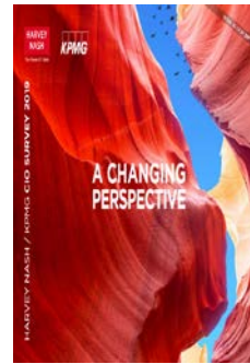
Harvey Nash/ KPMG CIO Survey 2019

The following are several recent examples.