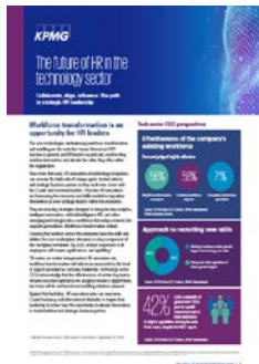
The future of HR in the technology Sector