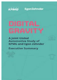
Digital Gravity: Joint global automotive study by KPMG International and Egon Zehnder