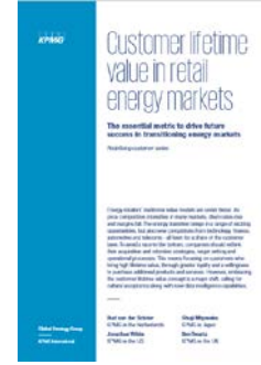
Customer lifetime value in retail energy Markets