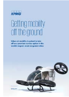
Getting mobility Off the ground