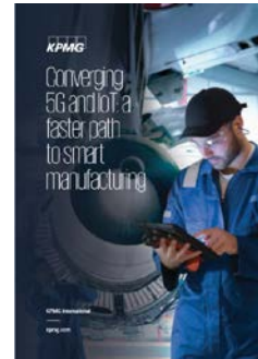
Converging 5G and IoT: A Faster Path To Smart Manufacturing