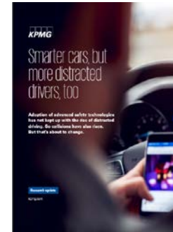
Smarter cars, but more distracted drivers, too