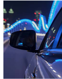
When automakers shift business models (Digital Article)

The following are several recent examples.