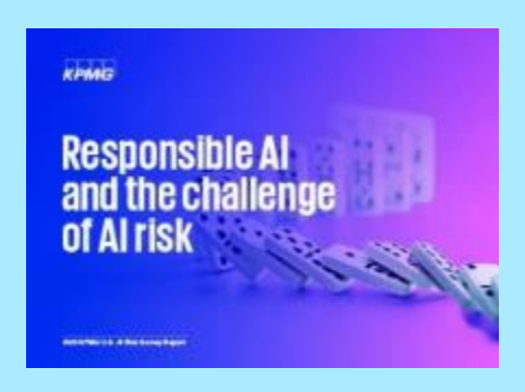
Download the paper