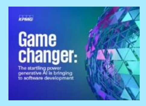
Download the paper