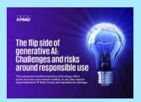
Download the paper