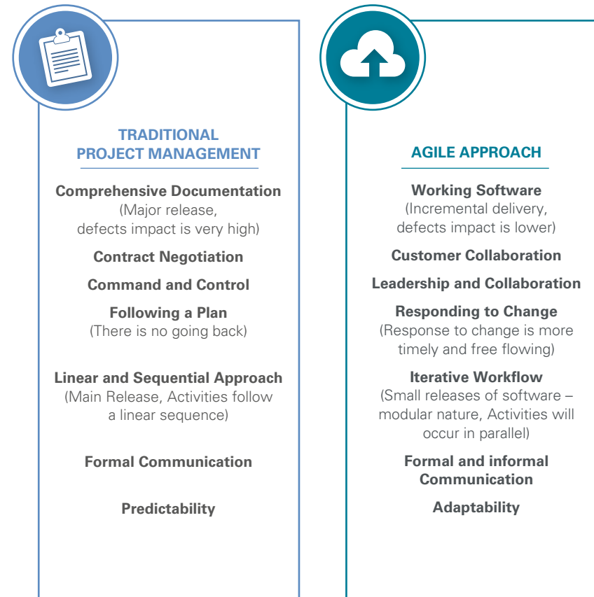
FIGURE 2: KEY DIFFERENCES BETWEEN TRADITIONAL AND AGILE PROJECT MANAGEMENT